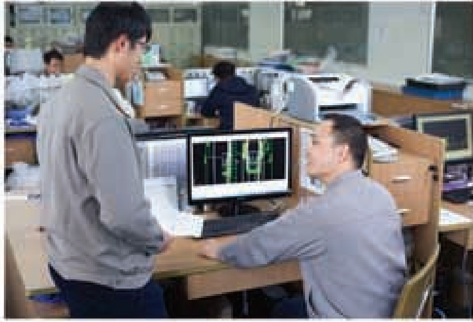
PRODUCT DEVELOPMENT 产品研发