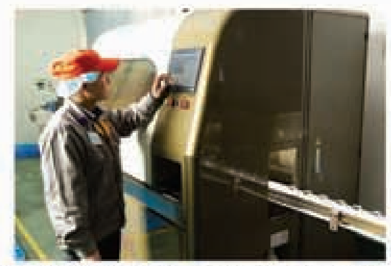
DECORATION WORKSHOPS / HOT STAMPING & SILK SCREEN 表面装饰加工车间 / 烫金和印刷