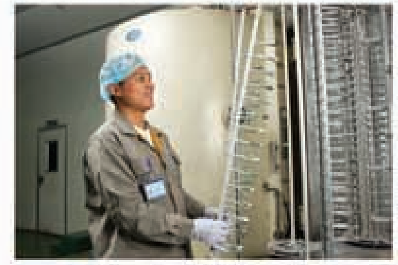
DECORATION WORKSHOPS / COATING & METALLIZATION 表面装饰加工车间 / 涂膜和真空电镀

AUTOMATIC PRODUCTION 自动化生产 MECHANISM AUTOMATIC ASSEMBLING 中策芯自动化组装