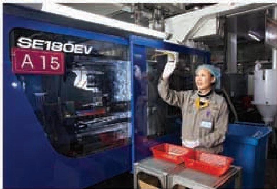
INJECTION WORKSHOP 注塑车间