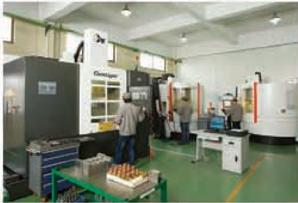
MOLD WORKSHOP 模具车间