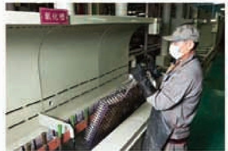
ANODIZATION WORKSHOP 氧化车间