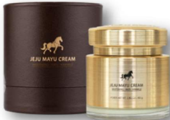
2중 기능성 화장품 (미백, 주름)